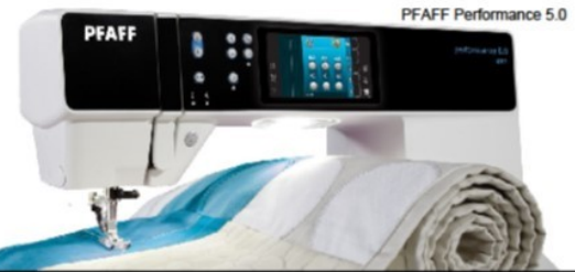
PFAFF Performance 5.0

3rd Monday of each month is TAX FREE DAY at the store; we pay the tax!