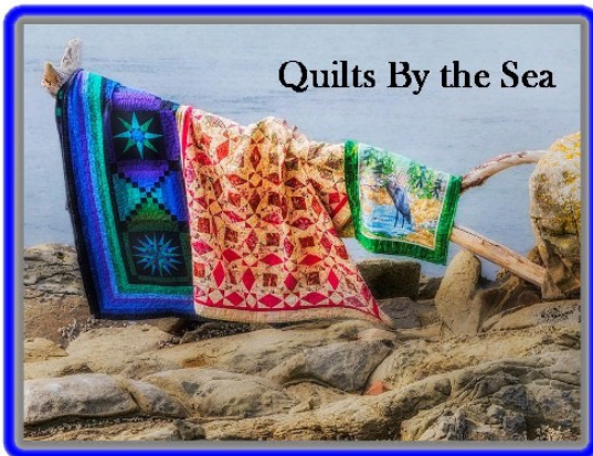
Quilts By the Sea