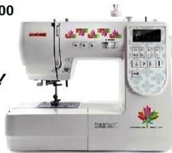
Janome M100 Special Edition

You Won't Believe It! Visit Us and See for Yourself!