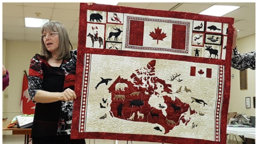
This is from April Show n' Tell