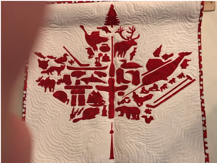
This is from the quilt show.