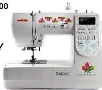
Janome M100 Special Edition

You Won't Believe It! Visit Us and See for Yourself!